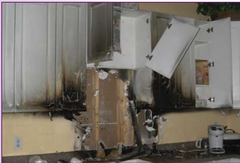
In October, our emergency shelter experienced a fire which destroyed the kitchen; smoke and water damaged the rest of the shelter. By December, Donna Lynne Custom Homes had led the way completing the renovation of the shelter.

Micah's Place is staffed 24 hours a day, 7 days a week, 365 days a year with caring advocates who are passionate about helping women in crisis. There is always someone available who wants to listen and who can help.